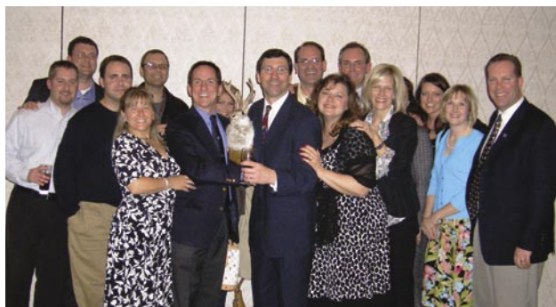
80s/90s Alumni at Re-Chartering Banquet

Finally and quite importantly, we are planning more alumni events in the near future and we hope to see you all there. Your continued alumni support is invaluable!